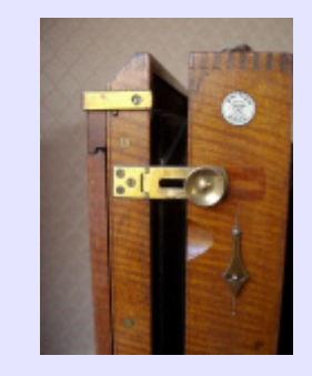
D. Swing-back feature