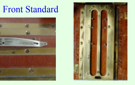
A. Locating pins on the base - 1 or 2 or 3 pairs.