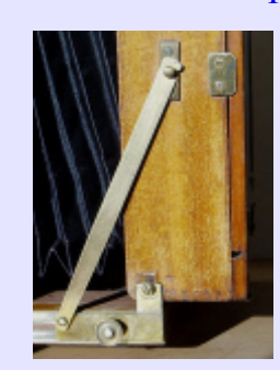
A. Hinged struts that locate into brass posts