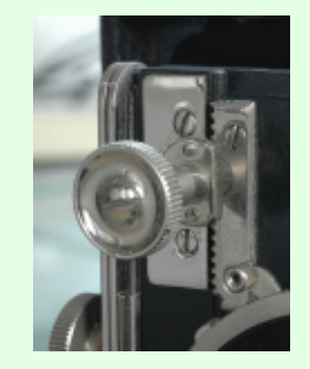
J. Rack and pinion to raise lens panel.