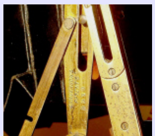
S. Struts attached to the arms that swing to the rear