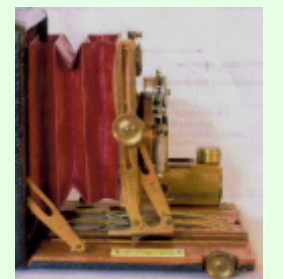
T. Curved arm at the front and a cranked arm behind