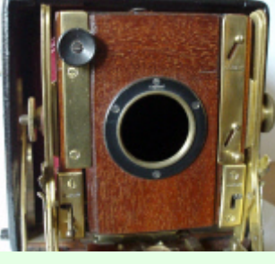
I. Tag on right replaced by a quick-release brass strip.