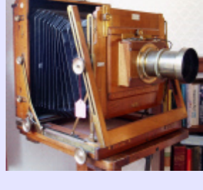
D. Oblong panel, quick