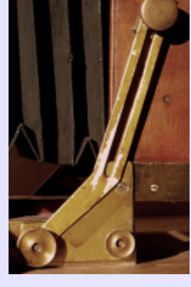
B. Cranked arms with straight slots