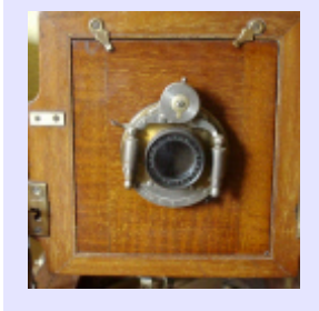
A. Square removable panel